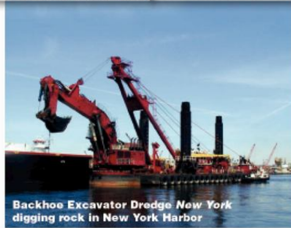
Backhoe Excavator Dredge New York digging rock in New York Harbor