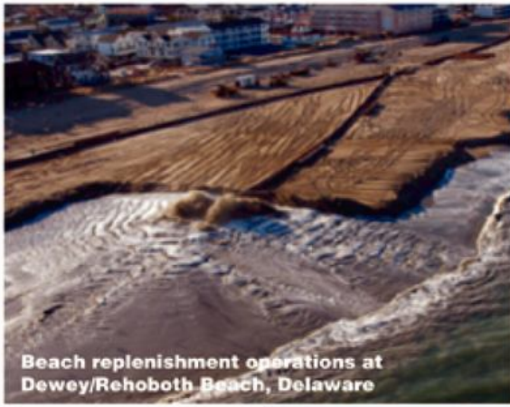
Beach replenishment operations at Dewey/Rehoboth Beach, Delaware