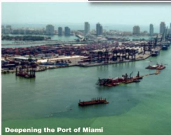
Deepening the Port of Miami