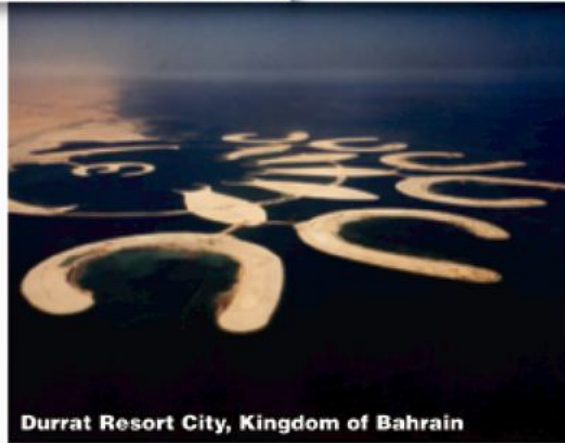
Durrat Resort City, Kingdom of Bahrain