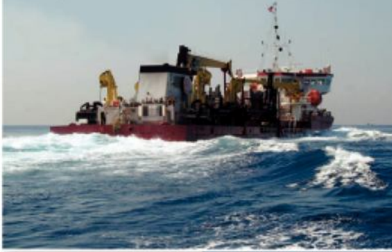
Trailing Suction Hopper Dredge Liberty Island en route to disposal area at Broward County Beach, Florida