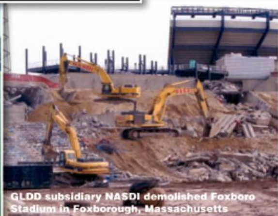
GLDD subsidiary NASDI demolished Foxboro Stadium in Foxborough, Massachusetts