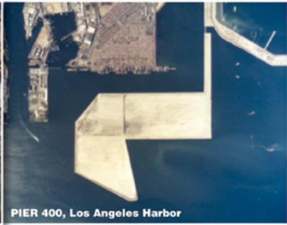
PIER 400, Los Angeles Harbor