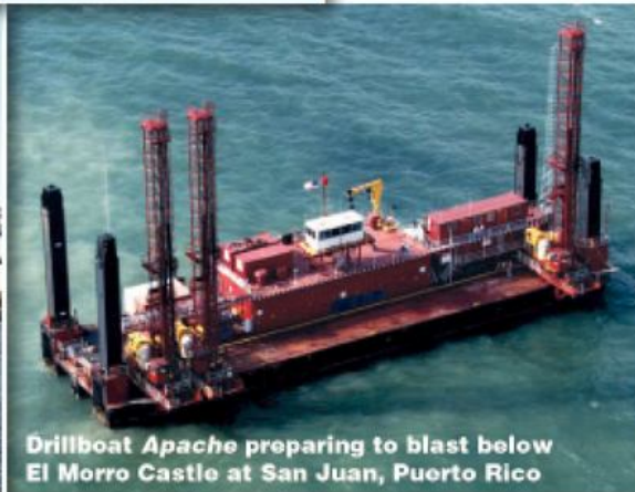
Drillboat Apache preparing to blast below El Morro Castle at San Juan, Puerto Rico